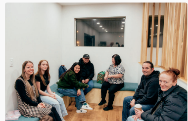
Enjoying our new foyer on Christmas Eve.