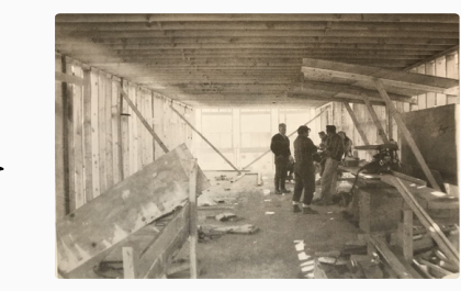
The beginnings of our foyer in 1973.